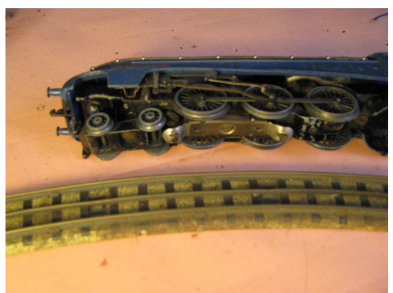
Hornby Dublo 3-rail locomotive and track, showing central skate power pickup.

Historically, an insulated middle (third) rail supplied electricity to the motor via a "skate" under the locomotive which slid along the rail, and the electricity was returned to the transformer via the locomotive's wheels. Pre-war Hornby and current Lionel 0-gauge electric trains use this system. A similar third-rail system was developed by Marklin for its H0 models before World War 2 and copied (in principle) by Hornby when they released their Dublo system in 1938. Marklin later improved the appearance of their tracks by replacing the third rail with "studs" which are still located between the main rails, appearing every 5mm or so. Hornby continued to use a third rail until they introduced a more modern 2-rail system in 1964.