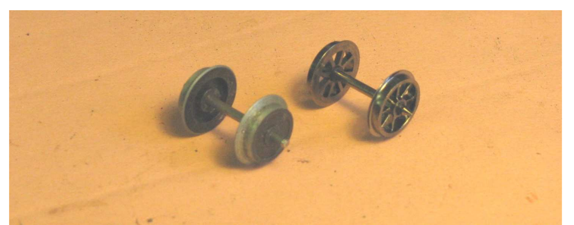
3-rail wheels (on left) and 2-rail wheels (on right). The 2-rail wheels have tiny insulating bushes between the axles and wheels.

Marklin and older Hornby Dublo coaches and wagons have metal wheels that are not insulated. They cannot be used on 2-rail systems, as they will cause short circuits. (They can, of course, be re-wheeled with insulated wheels.)