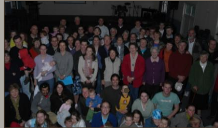
St. Luke's Getaway 2008